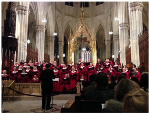
The Adult Chorale of St. Patrick's, Huntington, performing a concert at St. Patrick's Cathedral, NYC, Veterans' Day, November 11th, 2015.