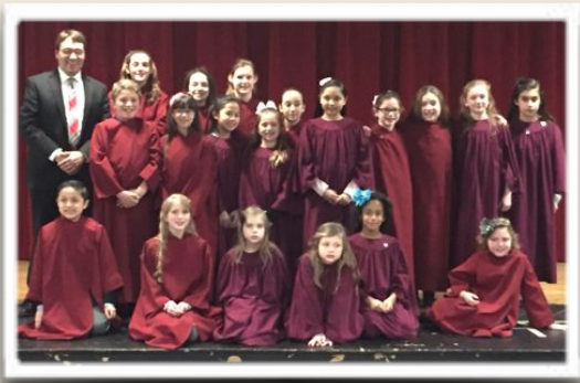
Members of the Youth Choir, after a successful performance in Suffolk's Annual Youth Choir Festival, Jan. 2016.

Please plan on attending what promise to be wonderful events in the life of our parish!